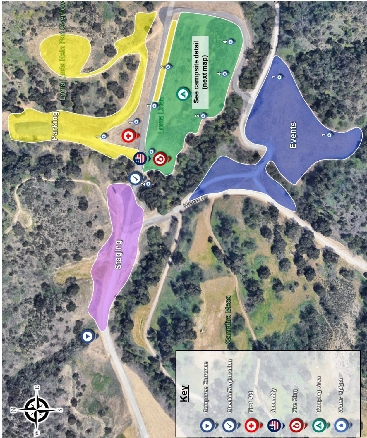
Campsite (Loma Linda) Area Detail