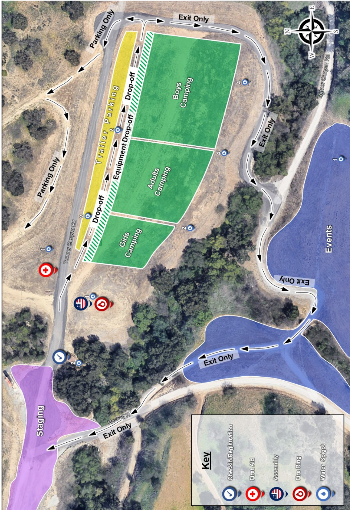
Camping and Parking Area Detail